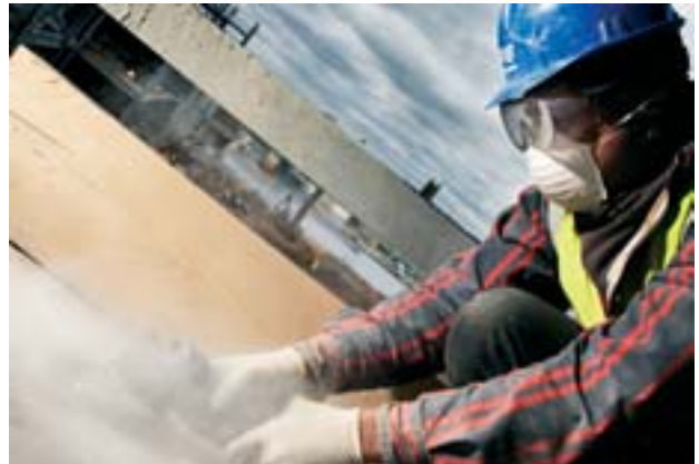
PICTURED: THE WESTFIELD EAGLE CENTRE DEVELOPMENT, DERBY.

Working together as a region Making challenging decisions Improving all our prospects