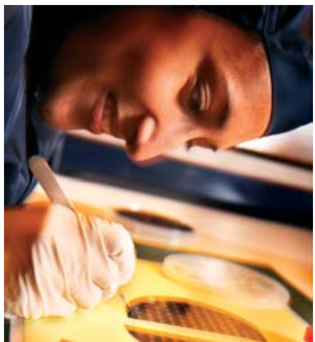
PICTURED: SILSON LIMITED, NORTHAMPTONSHIRE.

To support our vision, emda undertook groundbreaking work to develop a new way of measuring our region's progress. The resulting Regional Index of Sustainable Economic Wellbeing demonstrates that we are serious about growing our economy... and equally serious that the impact and benefits - to the environment and our quality of life - should be closely monitored to ensure our ambitions for economic growth are balanced with our commitment to sustainability.