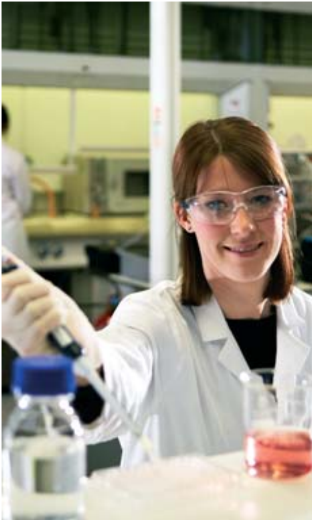
PICTURED: CRITICAL PHARMACEUTICALS, BIOCITY, NOTTINGHAM.

By believing in our vision for the East Midlands and all working together with one purpose in mind, we can achieve incredible things. We can achieve a truly flourishing region.