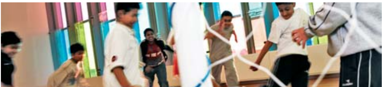
PICTURED: PEEPUL CENTRE, LEICESTER.

East Midlands Development Agency, Apex Court, City Link, Nottingham NG2 4LA